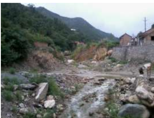
Figure 7. A view of Dahu village, July 2014.

iv. In Yangping County, there exists the Xiaohei River flowing through Dahu village receiving water discharged from their dressing mill. In Yuling town, there exists the Xiyu River, as the border of Henan and Shaanxi province, the water from which will be brought directly into the Yellow River. The big reason for concern is that a lot of slag was stacked along the river. During a heavy rain the slag along the river can be poured into the river easily.