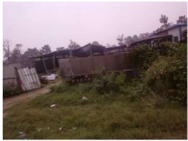
Figure 14. General appearance of workshops 桐峪镇一个典型的炼金作坊

ii. About twenty people worked as a team carried on mining activities there. Usually four or five trucks there wait for transporting the rocks. Two or three transferred rocks from the pit mouth to the trucks there. Most of the miners are employed from another place, the other part are the relatives of the owners, which were invited to manage the gold mine. Generally, small scale mining activities are conducted by village-owned and private-owned mines. Village-owned mines are funded from the village, and private-owned mines obtained money from some native rich man.