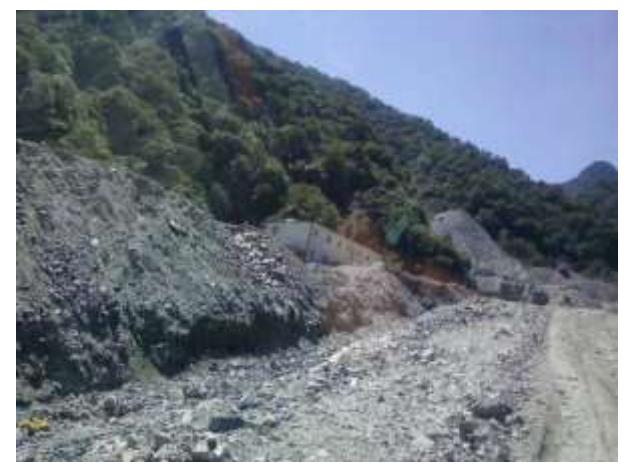
Figure 13 . General appearance of a mining factory in Tongyu town. 桐峪镇一个典型的金矿厂

i. The type of mining ore is hard rock. The mining and processing are in different places. The mining is in situ; however, the processing is usually in private workshops. The overall appearances of workshops, are similar to those in the first site, are simple sheds and easily to be recognized. Just four or five people are needed to operate a workshop. The water they used is groundwater. And most of owners there choose a pond or dig a pond as their tailings pond.