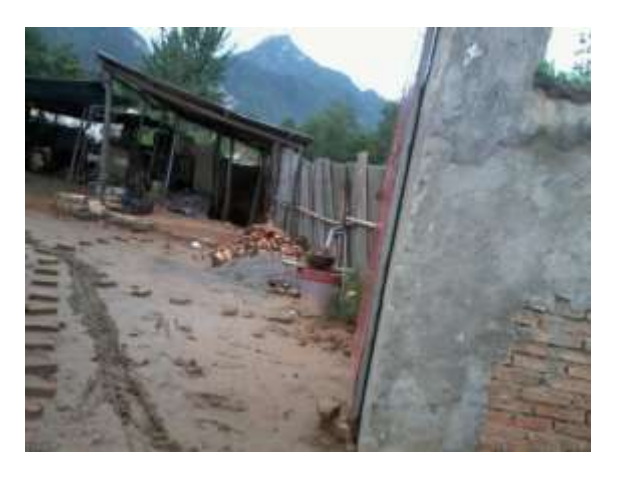
Figure 5. A full view of a family shop at Dongshe village, July 2014. 董社村家庭作坊全貌