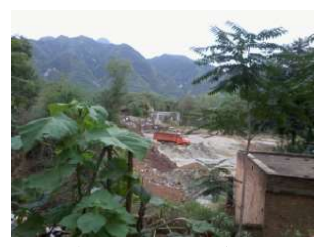
Figure 10. A truck is transporting ore waste, July 2014. 卡车运载着废矿渣,预灵镇

v. Because of the illegal sources of the ores, they always have no ore plant in situ. Miners use trucks to transfer ore to ore plant.