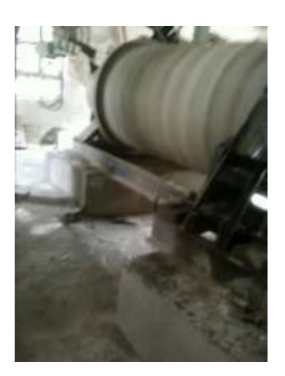
Figure 16. The ball mills they used in Lizhuang village, Tongyu Town. 桐峪镇 李家村 一个球磨机

vii. The owners usually choose some natural ponds or dig some ponds to store the tailings.