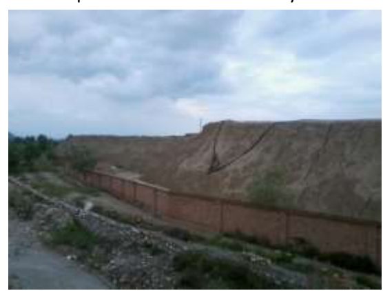
Figure 8. Slags along a river bordering Henan, Shanxi and Shaanxi, July 2014.