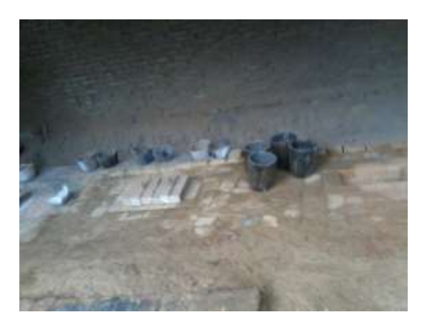
Figure 3. Facilities for burning amalgam at Songcun village,July 2014. 豫灵镇宋村的家庭作坊里煅烧汞齐的简易设备