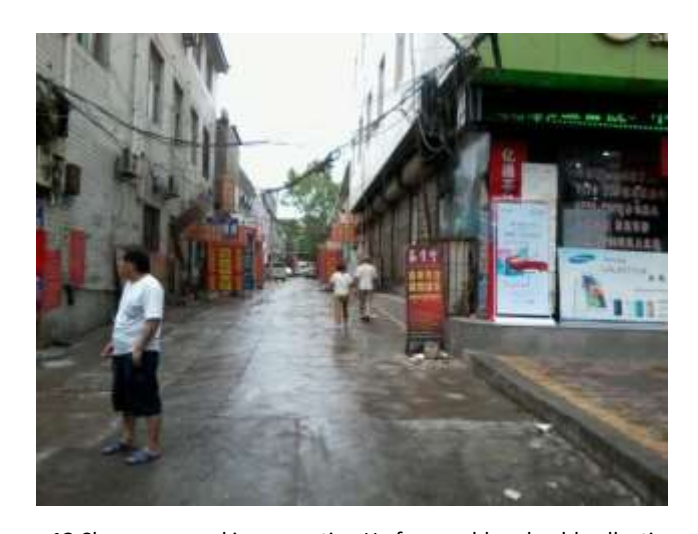
Figure 12. Shops engaged in separating Hg from gold and gold collecting. 阳平镇街头经营金汞齐分离和收购黄金的店铺很多

viii. Quite a number of owners use amalgamation to get gold. They put amalgam into a crucible, and then distill them. At last, Hg is transformed into the air, and gold is left as raw gold.