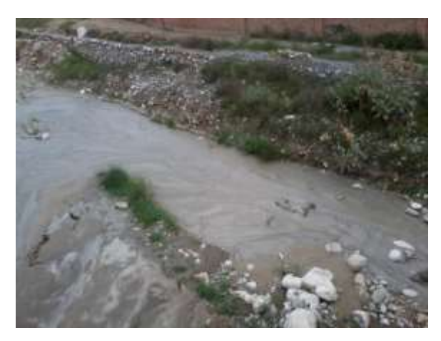
Figure 9. The dirty water flows directly to the Yellow River, July 2014. 污水经西峪河排入黄河