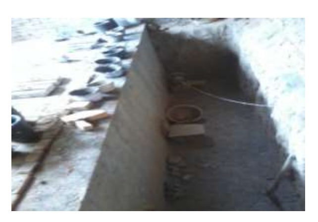
Figure 4. Pit-furnace of the family mill at Songcun village, July 2014. 豫灵镇宋村的家庭作坊里煅烧汞齐的简易坑炉