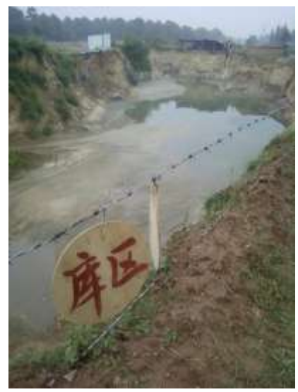
Figure 17. A reservoir area for tailings. 桐峪镇一个用来堆放废矿渣的水库

viii. Generally, they called the final gold-coarse gold.