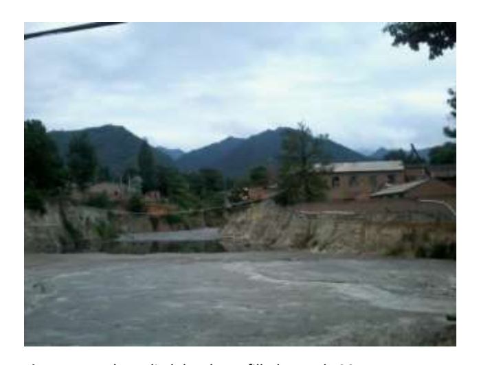
Figure 11. A deep ditch has been filled up, July 2014. 预灵镇的一条深沟已经被废矿渣填平

vii. They always piled the tailings on some wasteland, or poured them into some dry ditches. The ditches that they used would act as tailings pools.