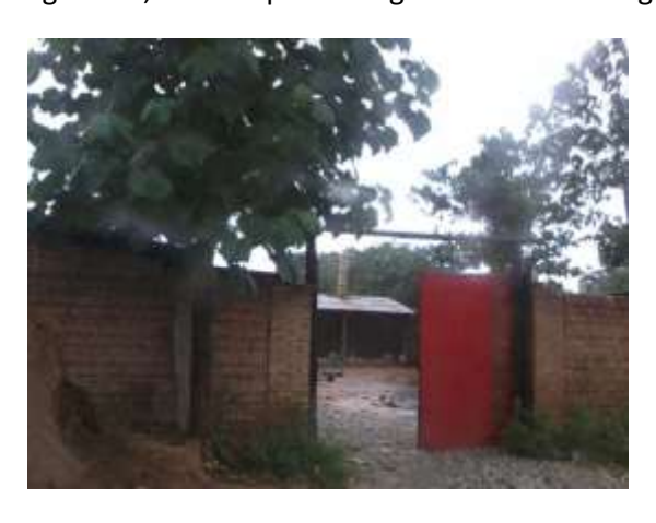
Figure 2 . A typical family mill at Dahu village on July 6, 2014. 阳平镇大湖村一个典型的家庭炼金作坊

ii. In these two towns of Yuling and Yangping, the processing scales are small like family workshops. The owners usually hire two or three people from other poor areas to run the workshops or run them by themselves. As the international gold prices decreased and the local governments strictly control illegal Au mining and processing, only one was found active among approximately 50 existing workshops. The main equipment is mills and crucibles. Gold workers use underground water as their sources of water. After smelting, slag was stacked into nearby open pits, or transported to some distance away from those smelting workshops. At processing places, there were often two or three skilled processors. All workshops are situated in the villages in family units.